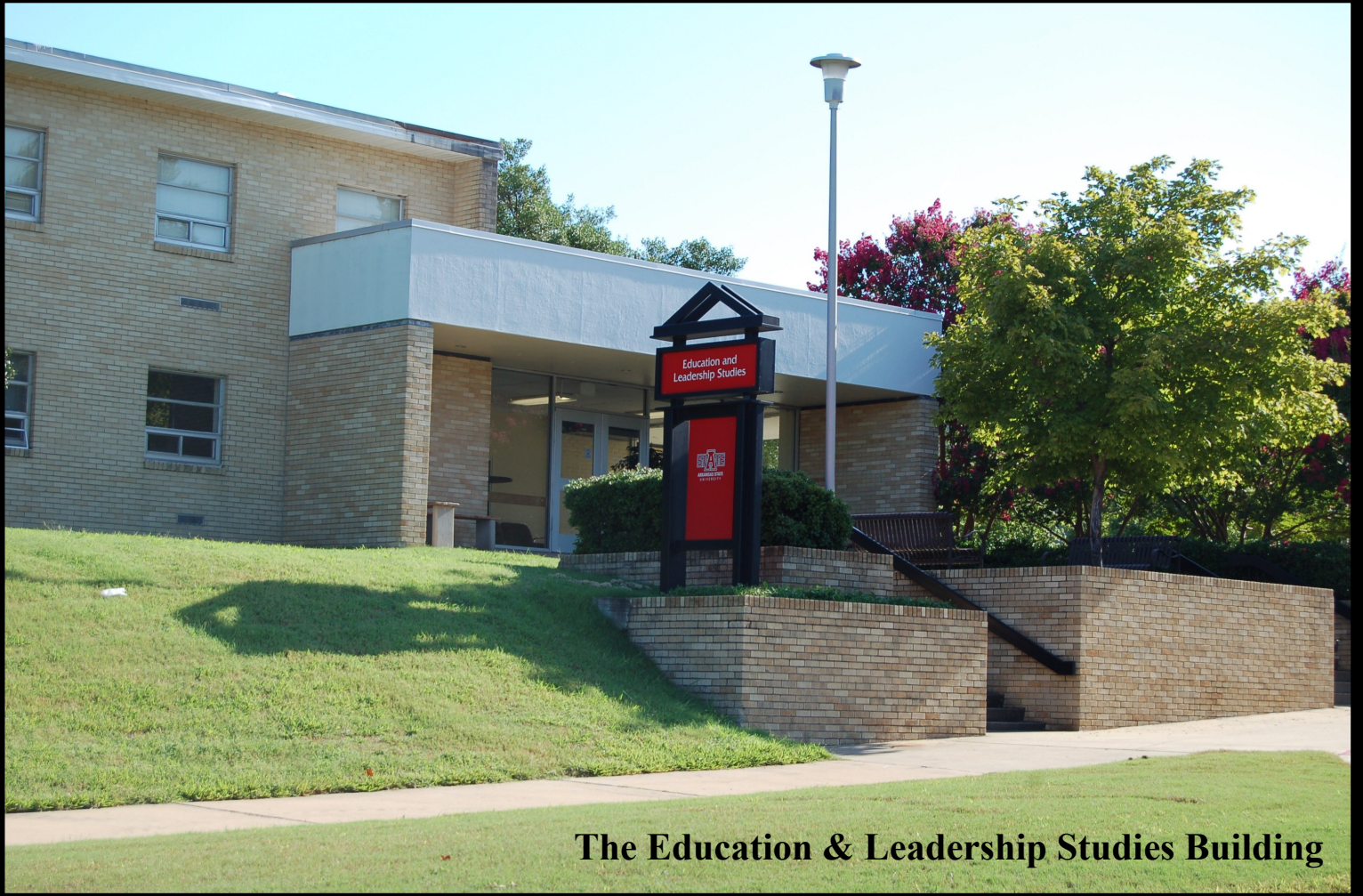
The Education & Leadership Studies Building

Our progress as a nation can be no swifter than our progress in education. The human mind is our fundamental resource.